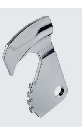
Enhanced tensile steel hook with 4.5mm compression chamfer.

The Trulock<sup>™</sup> range is available with several faceplate and backset options: